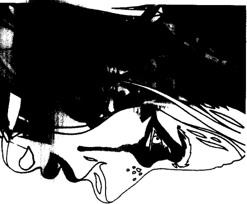
Man and the Machines page 36