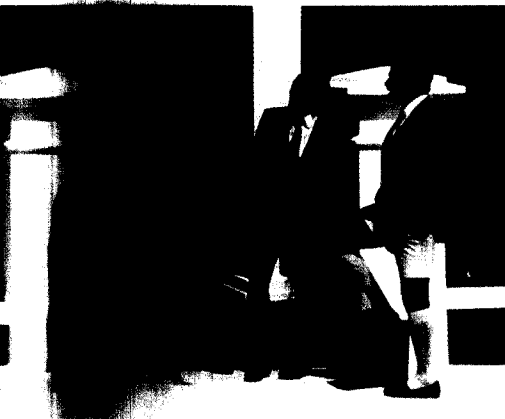
The Corporate Tax is Dying! page 20