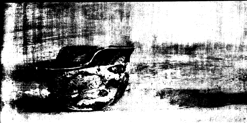
Insult to Injury page 26