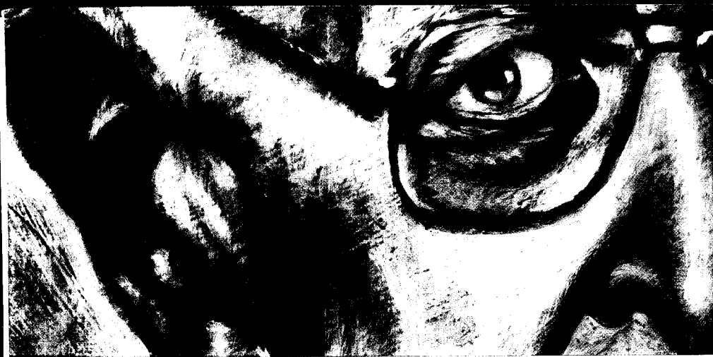
The Brains Behind Blackmun page 26