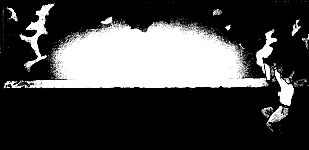
Behind the Hedge