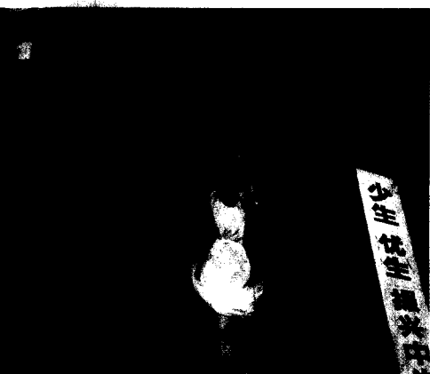
Leaving One-Child Behind page 8