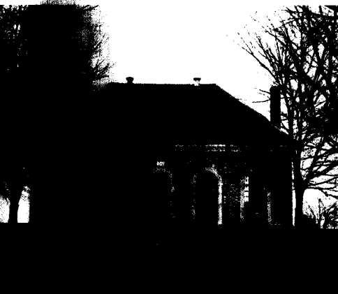
A Blueprint for the Future page 40