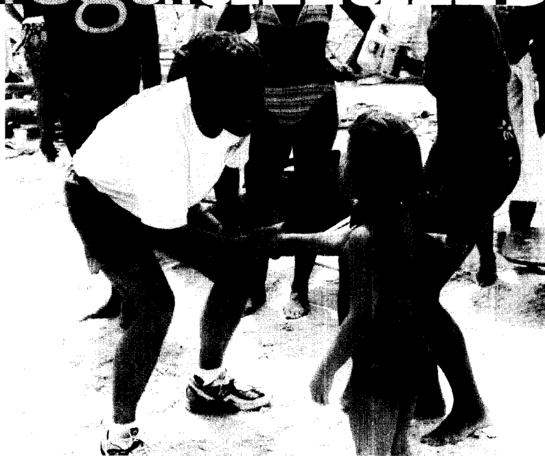
The Trials of John Edwards page 46