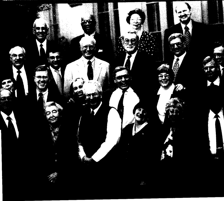
The Big Kozinski page 22