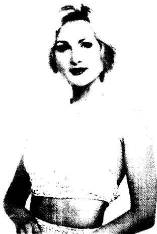
Mrs. America page 61

Living on a judge's salary, suing your lawyer for malpractice, and other ideas from the nation's law reviews.