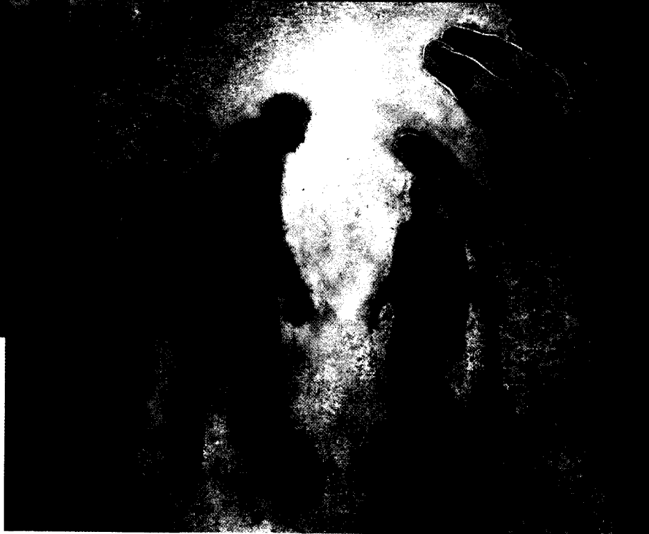
The Problem of Prison Rape page 24