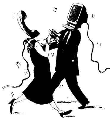
Call Forwarding page 69

The power of private law, in praise of Canada's answer to the Patriot Act, and other ideas from North America's law reviews.