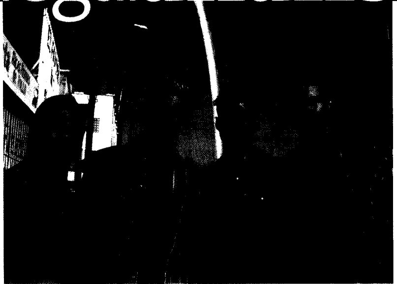
L.A. Lawlessness page 56

Ducking the death penalty, making a federal case out of local corruption, and other ideas from the nation's law reviews.