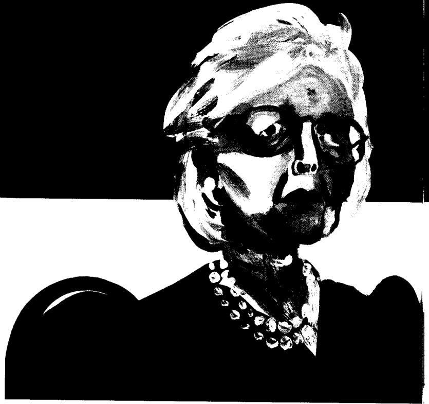
A Bold Stroke page 30