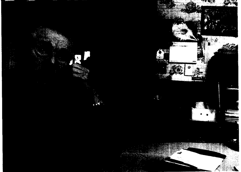
Blitzkrieg page 69