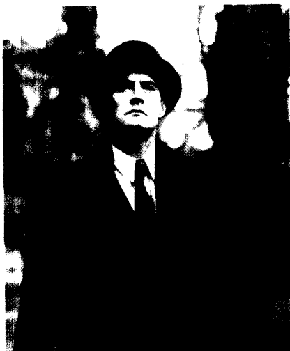
The Moral of the Story page 55

The LSAT's need for speed, the problem of false confessions, and other ideas from the nation's law reviews.