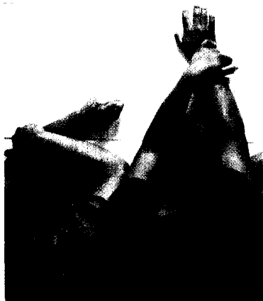
The Other Detainees page 58

Trial courts get horizontal, lawyers get religion, and other trends from the nation's law reviews.