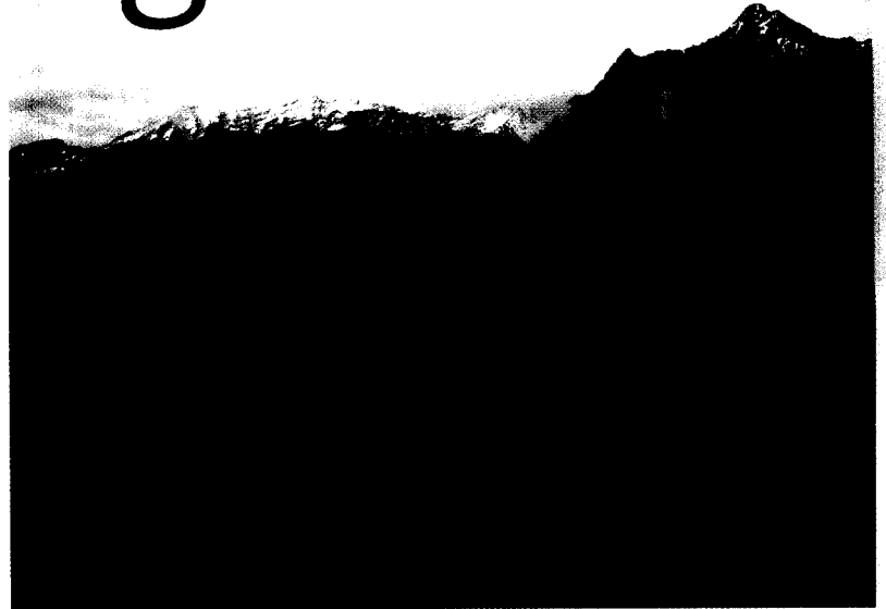
Moving Mountains page 71