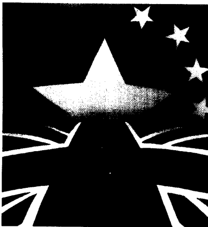
One Country, One System? page 61