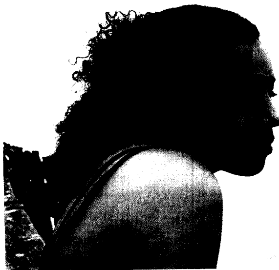
Catch-21 page 36