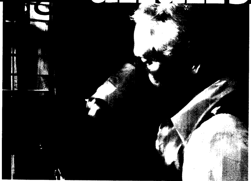
Reversals of Fortune page 48