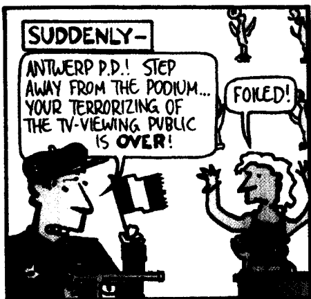
Belgian Supercops page 49

Supermajority rule, the rights of posthumously conceived children, and other ideas from the nation's law reviews.