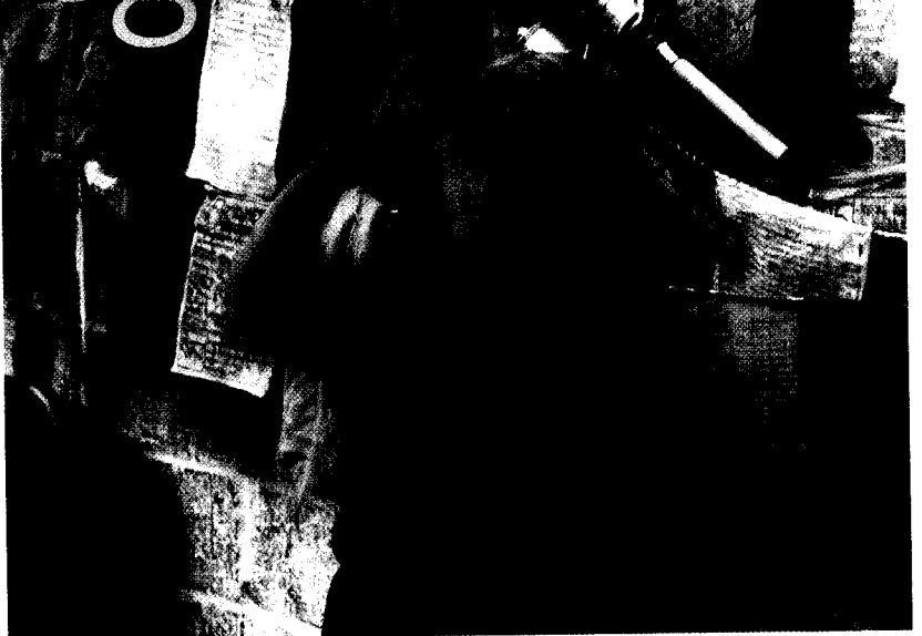
Tibetan Murder Mystery page 36