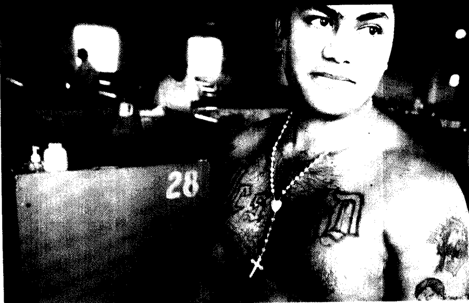
When God Goes to Prison page 22

The Bush Administration could gain the trust of the world by obeying the law of occupation.