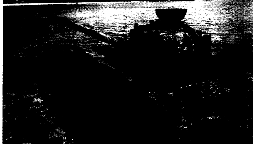
Second-Class Citizens page 51