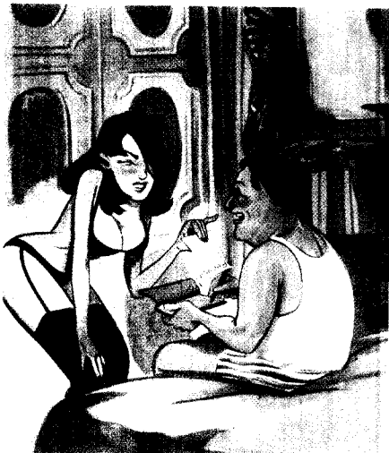
In Defense of Prostitution

Gun control statistics fall on deaf ears, canine courts, and other ideas from the nation's law reviews.