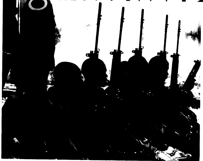
Cleaning House page 69