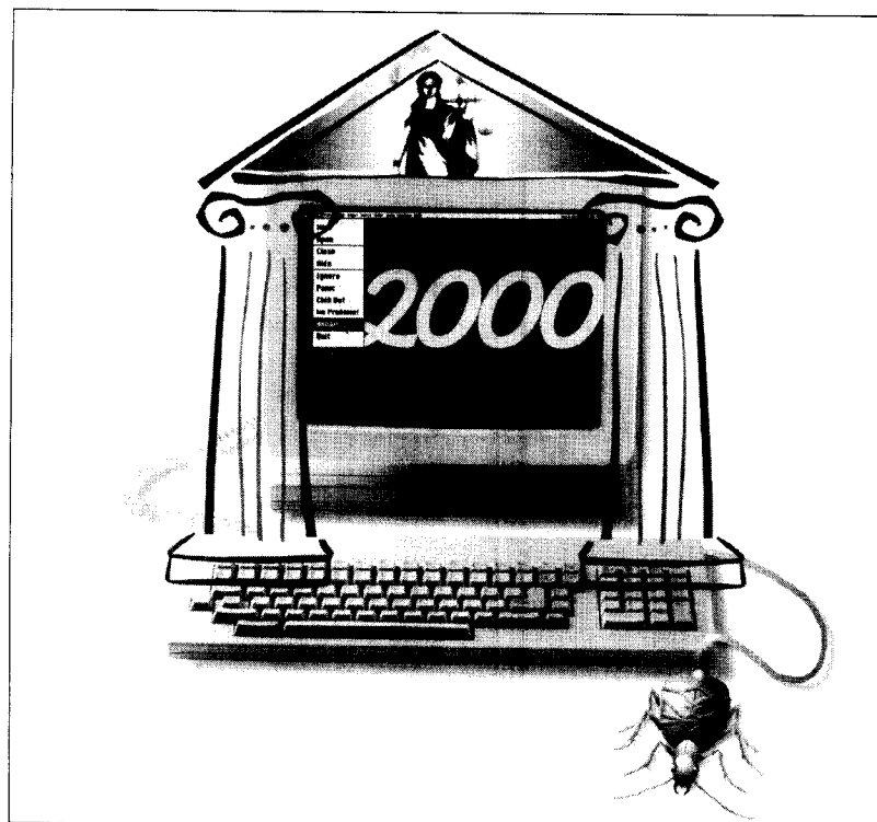
Courts battle the bug, page 232

Briefs 240 Alliance takes on domestic violence; Jury reform pays off for New York; New Supreme Court guide online