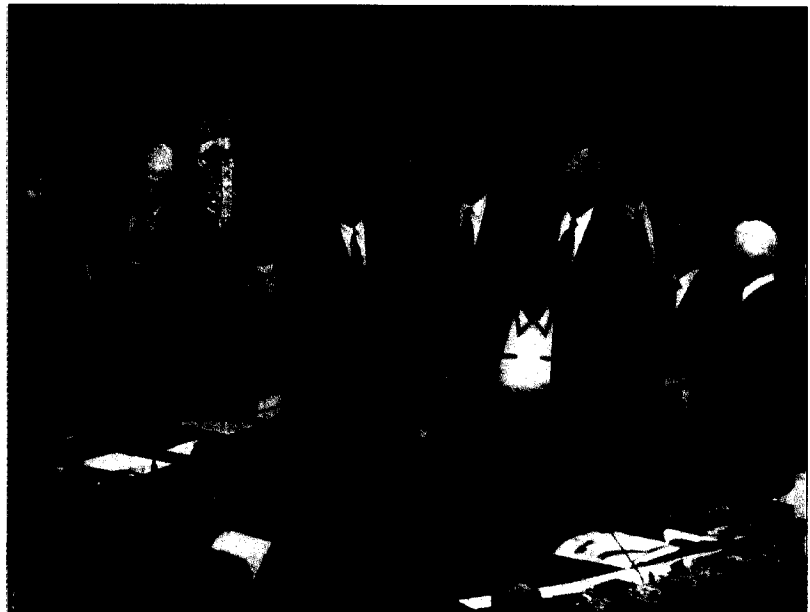
The courts and impeachment, page 184

Attitudes toward courts; administrative law; help for heart attack victims