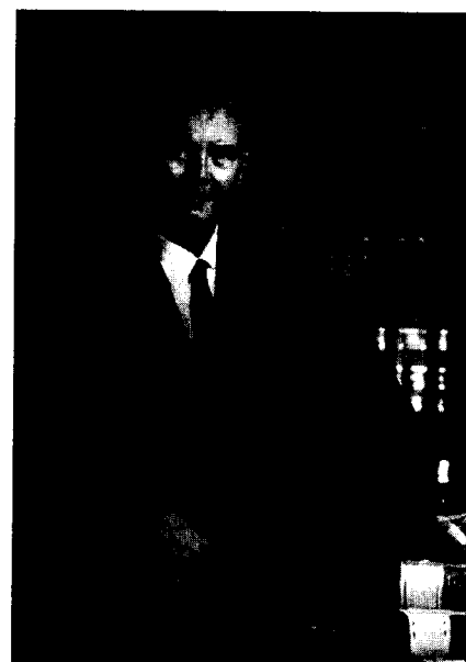
Justice William Brennan Jr.